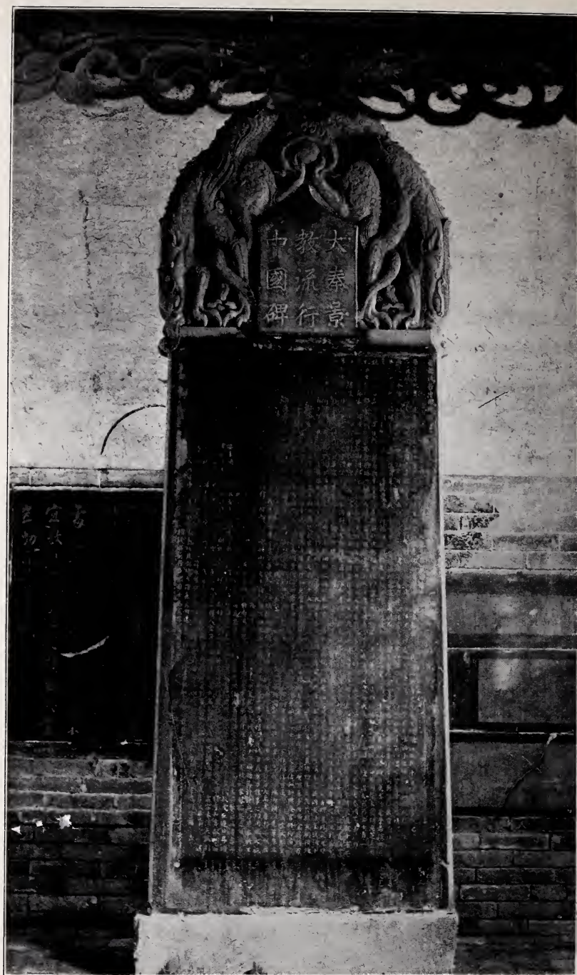
THE ORIGINAL NESTORIAN STONE.

As it now stands in the Peilin or "Forest of Tablets" in Sianfu.